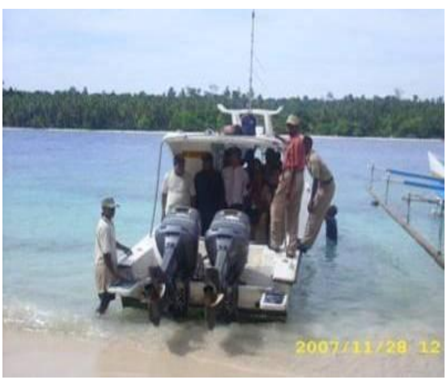
Pioneering new CLCs establishment in isolated area