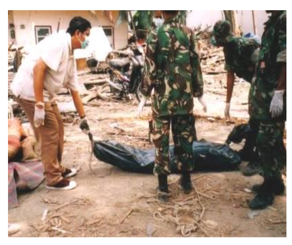
POSIKO FK-PKBM-INDONESIA AKSI PEDULI BENCANA