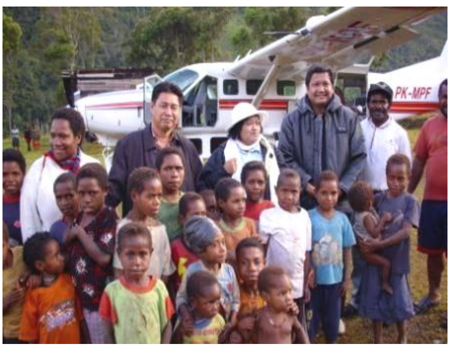
Pioneering new CLCs establishment in isolated area