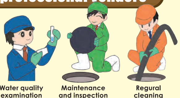
Water quality examination